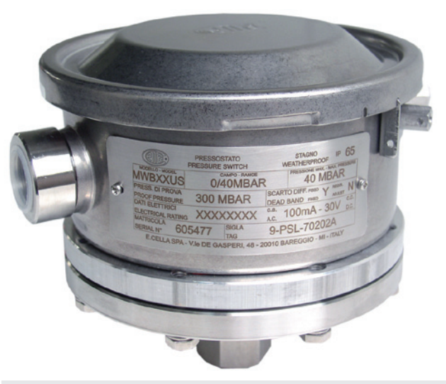
Diaphragm Pressure Switch Model MWB